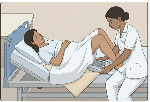
Step 5: Use a bedpan to urinate or defecate