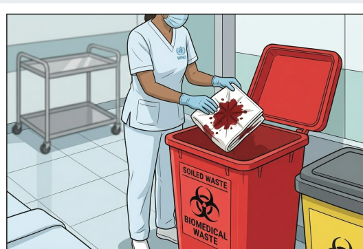
Step 7: Safe disposal in the red bin