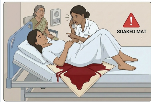
Step 6: Identify PPH and initiate intervention