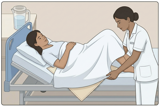
Step 3: Maintain the privacy and direct contact