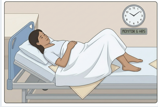
Step 4: Monitor for 6 hours or until leave the facility