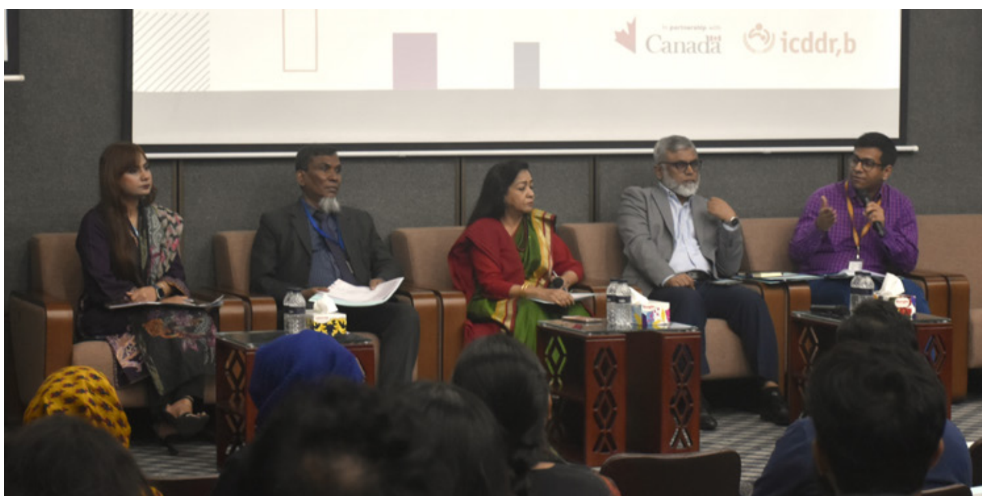
Panel discussion on Understanding the context and needs related to SRHR among newlywed couples in Bangladesh at the icddr,b Sasakawa Auditorium.

Among the four cohort studies under AdSEARCH, the newlywed couple cohort study in Bangladesh has revealed evidence on early marriage, Intimate Partner Violence (IPV), and high rates of mistimed pregnancies in selected rural areas and urban